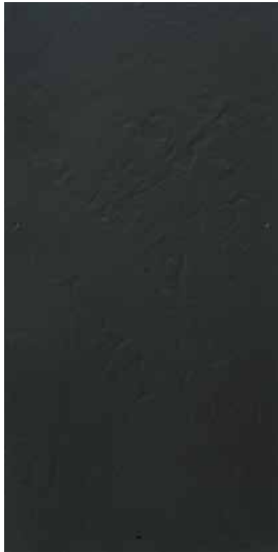
Blue / Black

Zeeland slates are available in 600 x 300mm format in Blue/Black and Graphite colours with a textured surface.